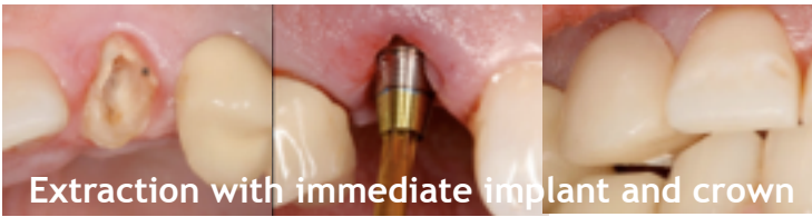
Extraction with immediate implant and crown