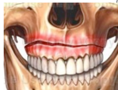
Upper jaw fracture